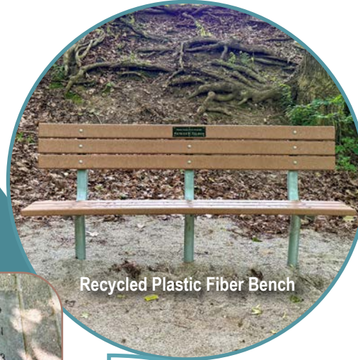
Recycled Plastic Fiber Bench