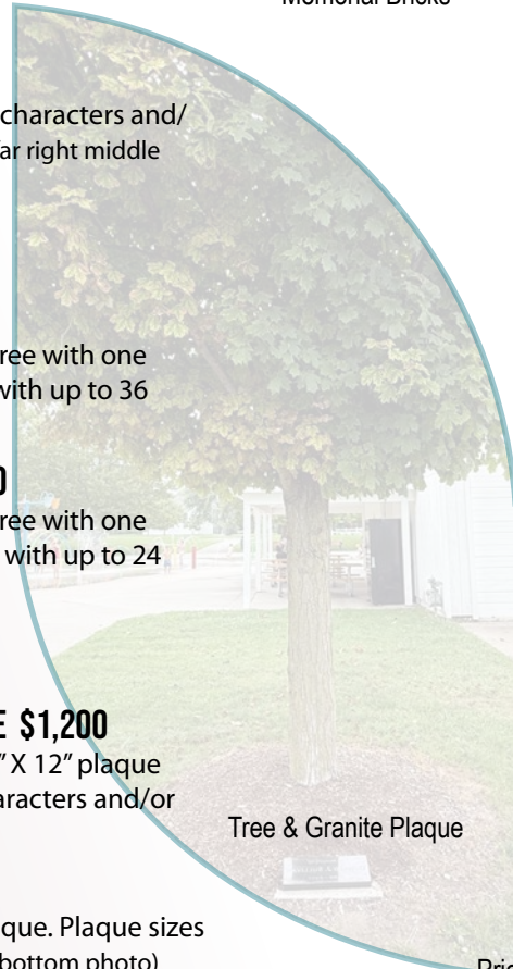
Tree & Granite Plaque

High quality benches with a mounted plaque. Plaque sizes vary by bench style and location (far right bottom photo)