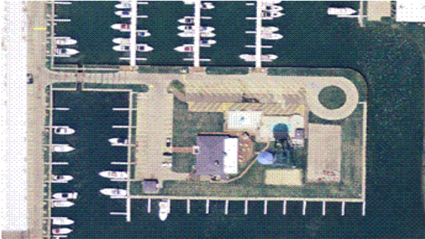
Year 2005, Color, 6 inch pixel resolution

St. Clair County will use the new color images for many purposes. The Metropolitan Planning Department will use them as a base layer for the GIS (Geographical Information System). They will be useful when shown with zoning, master plan, wetland, floodplain and census data to predict future growth and development. The Land Management Suite can access the imagery for measuring the square footage of houses, acreage calculations of fields and ponds, and examining parcels. The Sheriff's office and Office of Emergency Management can use the new color imagery for incident mapping and general law enforcement. Other county departments such as the Health Department, Drain Commissioner's Office and the Road Commission will also find them beneficial while preparing information for fieldwork. Please see a visual comparison of the two types of imagery below: