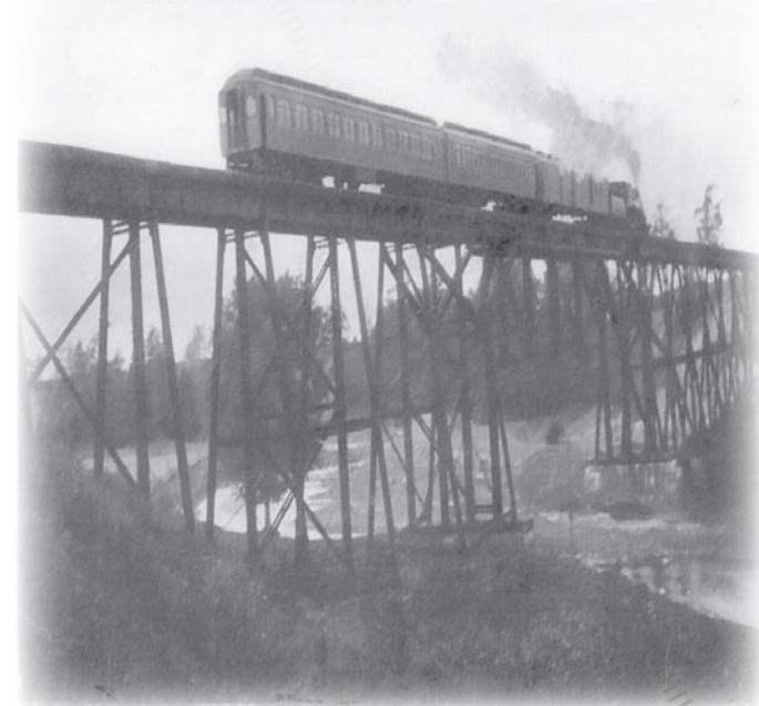
This picture, showing a passenger train crossing the Mill Creek Trestle, was published on a post card around 1900.