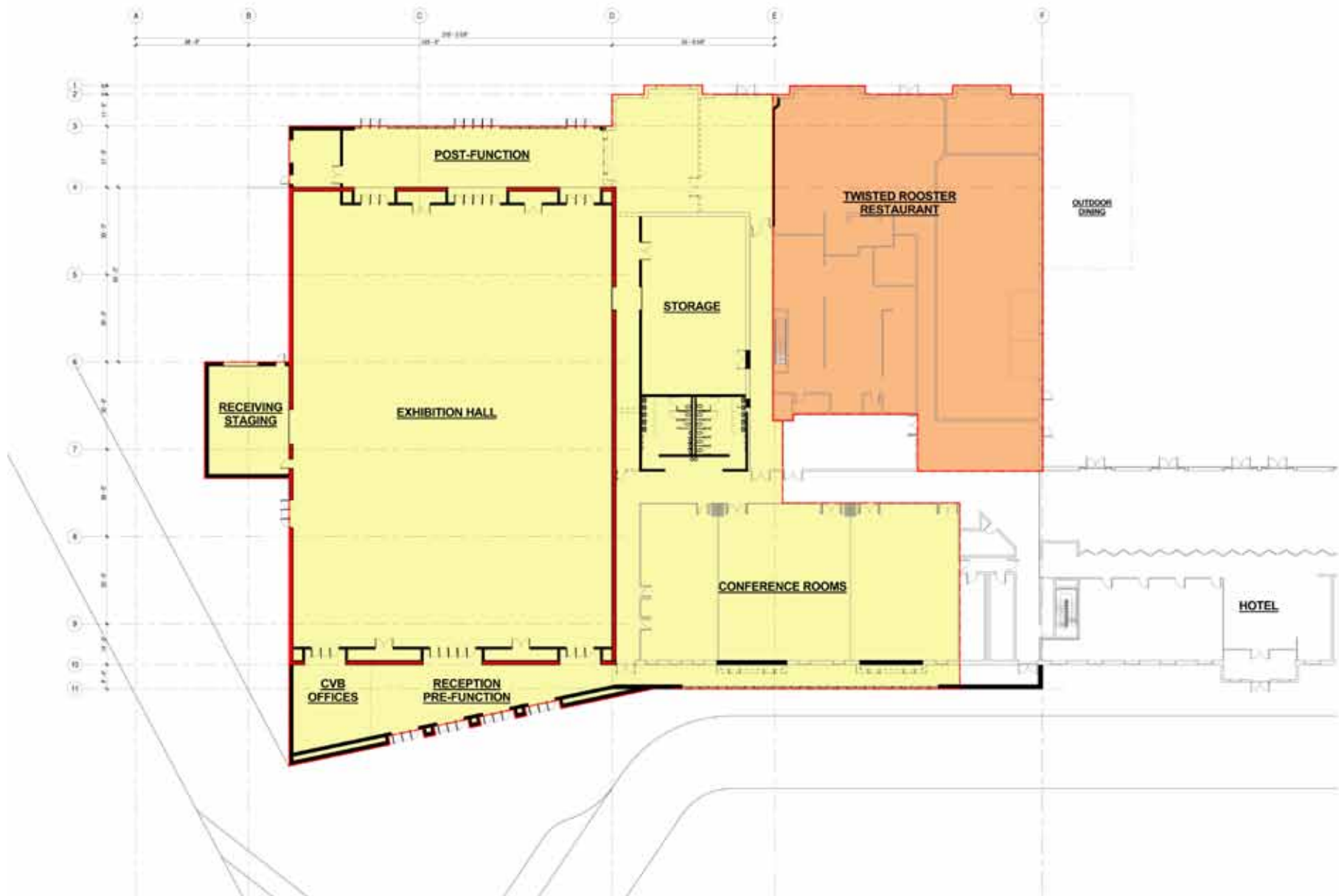
CONVENTION CENTER FLOOR PLAN